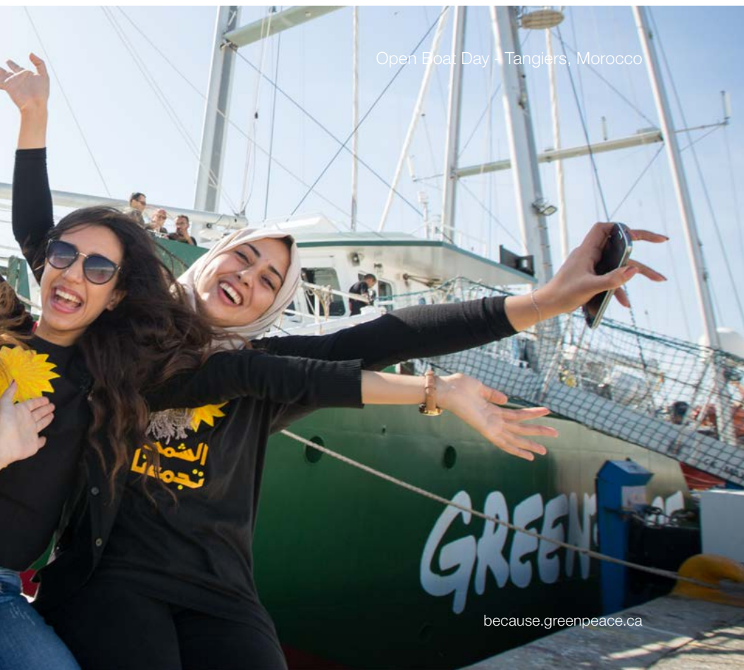
Open Boat Day - Tangiers, Morocco

A #BECAUSE fundraiser enables you to share your concern about the future of our planet and do something about it. Your #BECAUSE campaign will inspire others to think more deeply about environmental issues and donate to Greenpeace to help build a sustainable future.